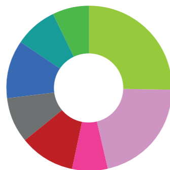
How your donations were used by Meal a Day in 2012