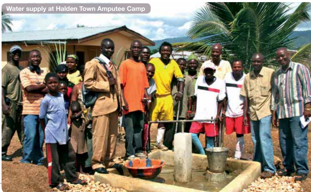
Water supply at Halden Town Amputee Camp

Meal a Day has also built and equipped a clinic for the area. The government will provide the nurses and medicines once the nurses' accommodation is completed.