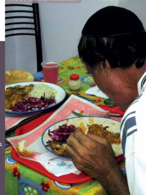
The Be'er Sova restaurant