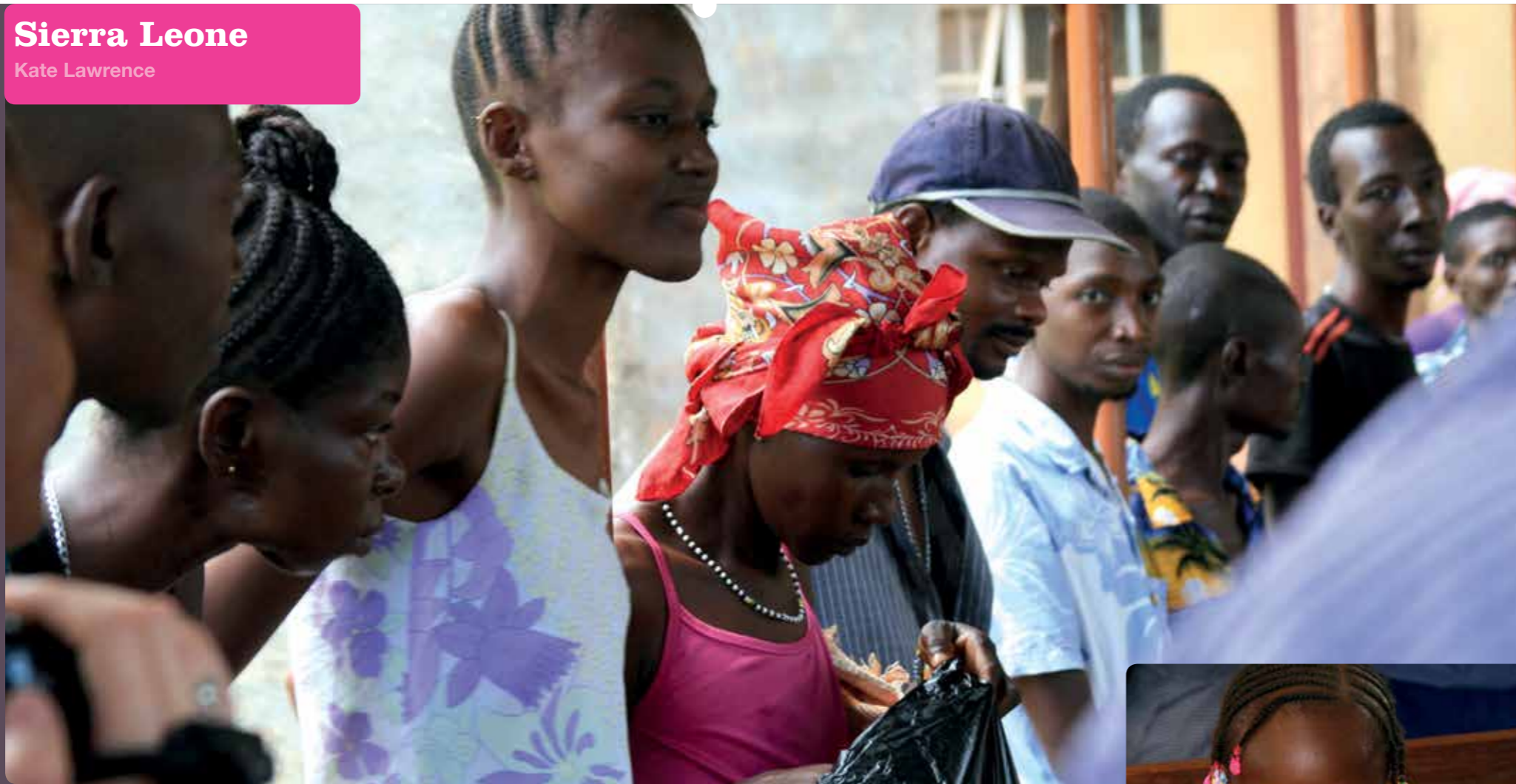
Left: Patients at Lakka Hospital Below: Lunch at Talia School, Sierra Leone

‘The trauma of war touched the hearts of everyone in Sierra Leone and many still talk of seeing bodies in the streets’