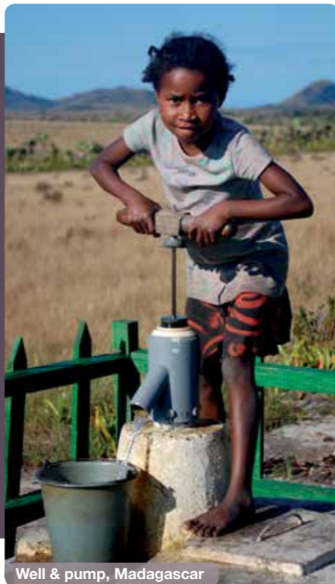
Well & pump, Madagascar

Meal a Day is working with Azafady in SE Madagascar to dig wells and to improve sanitation by encouraging communities to dig and use latrines. In a country where less than 30% have access to clean water and 40% of children die before their fifth birthday, Azafady is improving lives at the most fundamental level. So far communities have been supported in the completion of 314 latrines (benefitting 2668 people), the provision of four new wells, the repair of twelve existing wells and sanitation education for schools and communities.