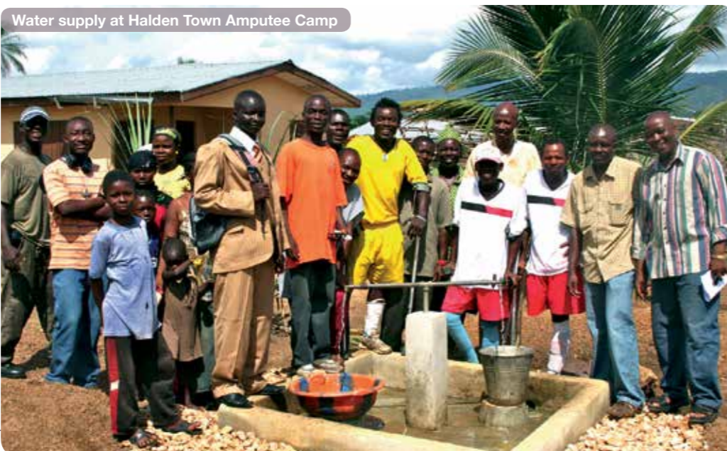
Water supply at Halden Town Amputee Camp

Meal a Day has also built and equipped a clinic for the area. The government will provide the nurses and medicines once the nurses’ accommodation is completed.